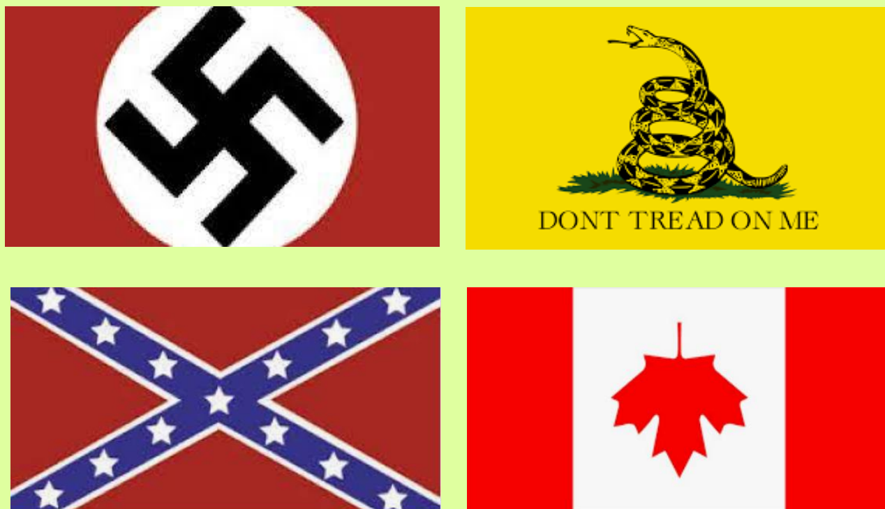
Figure 1. Symbols Used by Participants in the So-called ‘Freedom’ Convoy to Express Their Thoughts, Words, and Actions in Opposition to the Federal COVID-19 Mandate Regarding Cross-border Truckers

However, those in Table 2 along with the symbols in Figure 1 are sufficient to establish that for many people their real and perceived sense of freedom to think, speak, and act tend to be severely compromised when confronted by these symbols of hatred, racism, white supremacy, bullying and intolerance that were aggressively flaunted day after day for 23 days in downtown Ottawa, and shown repeatedly in broadcast media and social media productions. (Endnote 17)